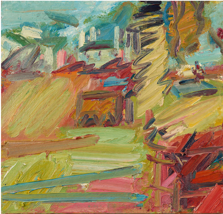
Frank Auerbach, The Pillar Box , 2011.